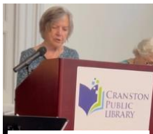
"Again and Again" Poem by Peg Paolino