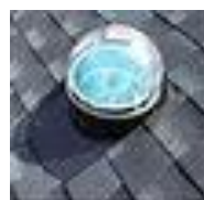
Photo of a Solar Tube Natural light in Home 24 Hours without using electricity