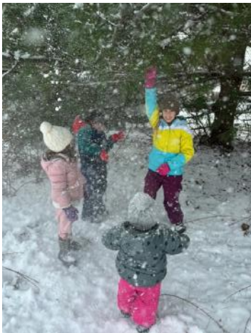
Children enjoy the snow at a Land Trust event at St. Andrews Farm.

Sunday, June 7, 1 pm – Summer History Walk at Johannis Farm Wildlife Preserve.