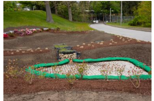
Redirecting Stormwater Through Infiltration