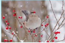
Northern Mockingbird