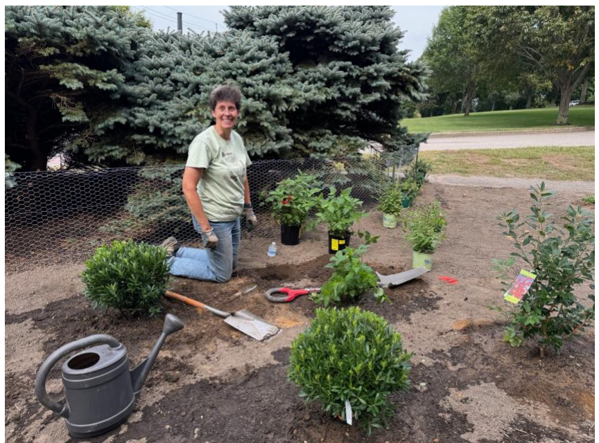
Photo of Town Resilience Garden Work Day

This event is for volunteers who have registered to participate in the care of the Town's Resilience Garden at Town Center. If you haven't registered yet and would like to participate, you may register here and download the Town's release of responsibility here. On Tuesday, July 22, we'll be doing general care and maintenance of the new Resilience Garden at Town Center. Free. REGISTER FOR THE WORK DAY