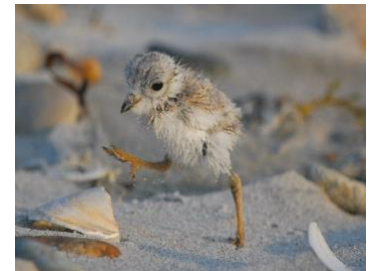
Photos of Goosewing Beach Preserve and the Piping Plover