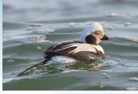
Long-tailed Duck