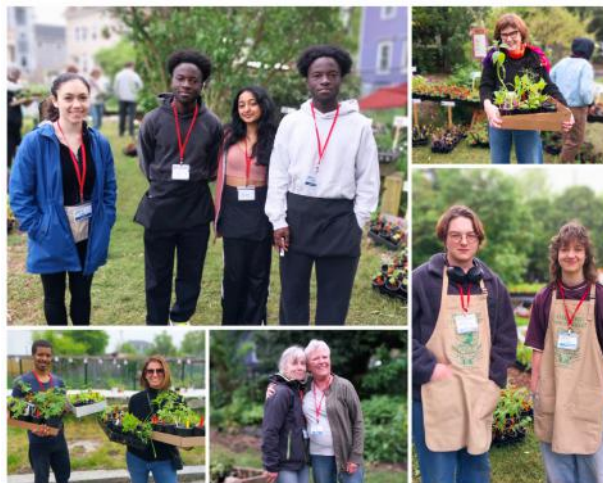
The 32 nd annual rare and unusual plant sale in June