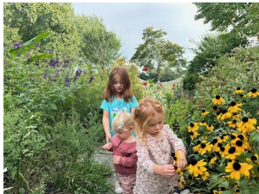
Photo by Gail Read Pollinator Pathways Barrington Land Conservation Trust

I imagine it still, where the stone bench sits, tangerine tiger lilies and moths putter. All the flowers she grew used to fit in Vavó's garden where we would flutter.