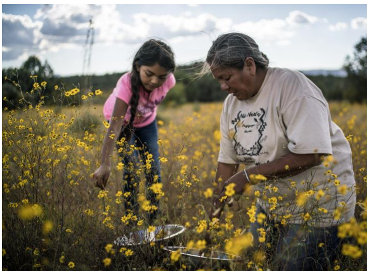
The documentary film Gather shows how traditional foodways and native plants influence the wellbeing of Indigenous Peoples.

The Barrington Land Conservation Trust has preserved nearly 300 acres of open space in perpetuity for the benefit of the public. For more information on the Land Trust and its properties, visit www.blct.org .