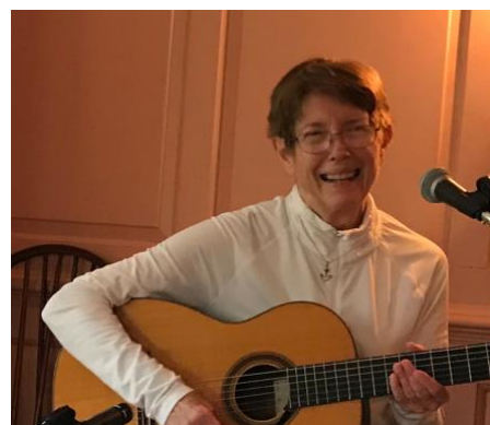
Nancy Carroll in Performance