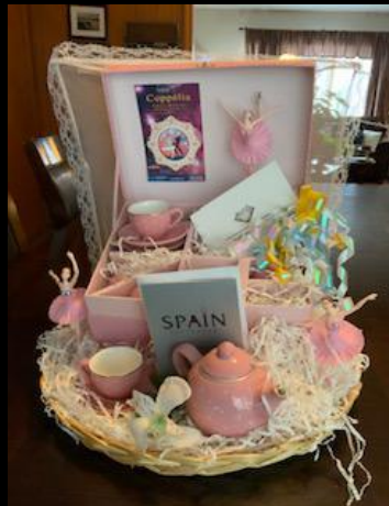
State Ballet of Rhode Island Basket