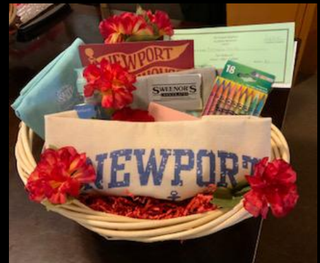
Night On the Town- Newport Playhouse Basket