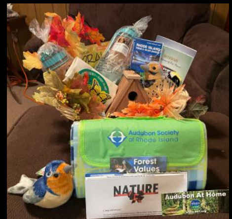
Audubon Society of Rhode Island Nature Basket