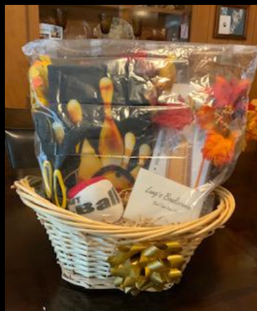
Bowling and Pizza for Six Lang's Bowlarama Basket